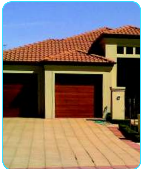
Colours are indicative and may vary during printing. Pavers are manufactured to meet AS/NZS3661 and 4456 performance criteria